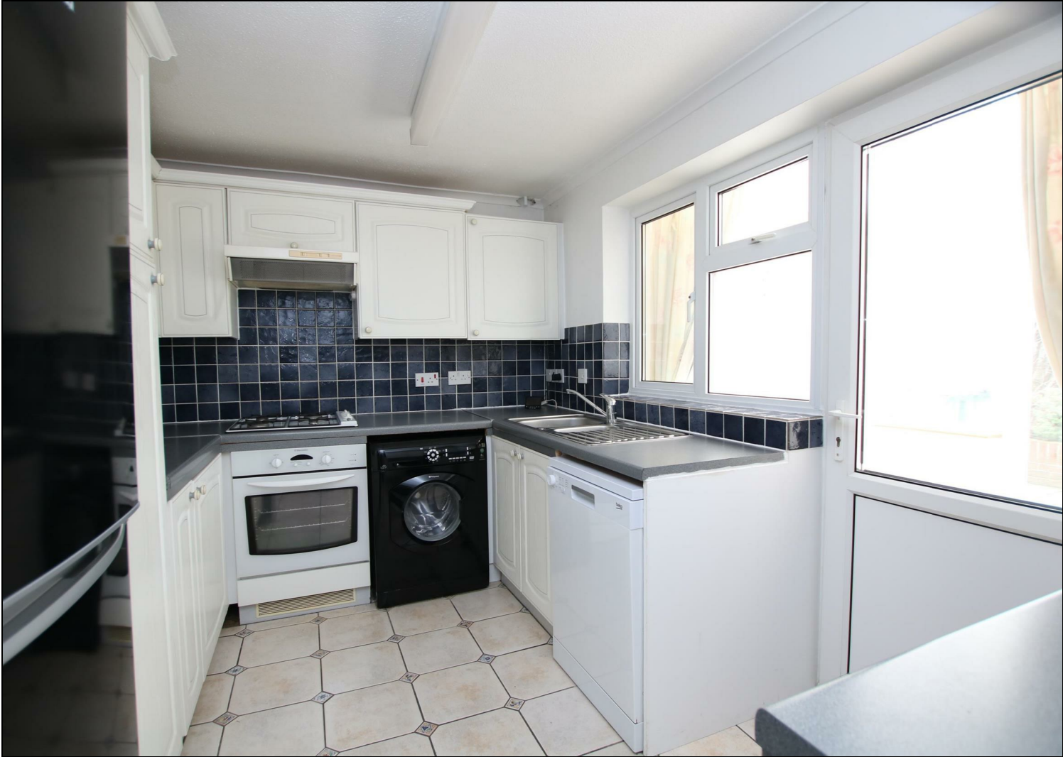
92 Beech Road